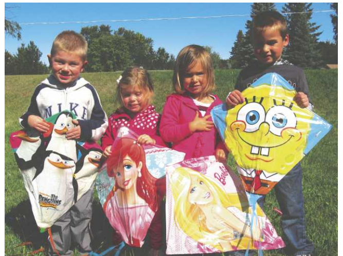
Kids enjoying Kids Club (article on page 9)