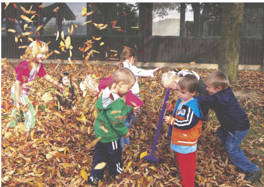
Preschool kids having a good time in the leaves